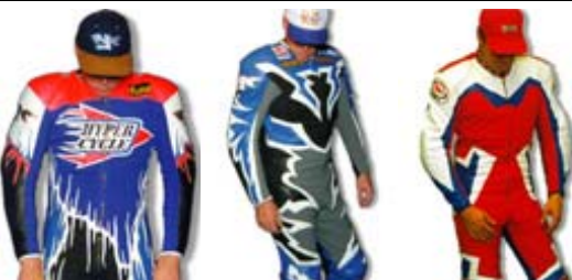
Examples of custom designs offered by NJK Leathers

Book of Motorcycle Knowledge — The club has started a scrap book of interesting articles pertaining to all facets of our favorite hobby—a small desk top copier is available at the meetings for your use to copy any articles you may want to keep or take a copy of your personal favorites and contribute to our "Book". Check it out at the next meeting!