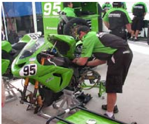
It's hard growing up green !

MEETING LOCATION Giovanni's Restaurant 9353 Clairemont Mesa (858) 279-6700