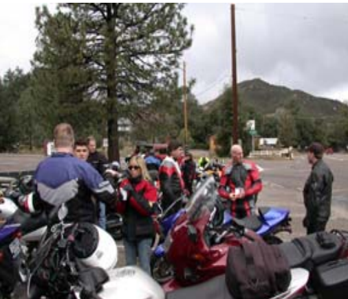
Clouds, Hot Chocolate, and good friends

The first ride of 2004 felt like a mini-Baby Butt 1000. Starting off with a chance of showers, we had wet roads to contend with as we headed out I-8 toward Harbison Canyon. The clouds were breaking up and the sun made it out just in time to enjoy the twists and turns of the back roads. Harbison Canyon looked like a cross between a nuclear winter and an old black and white movie due to the wild-fires that raced through there last fall. The starkness of the black & white canyon was broken up by the green of "Hydro Seeding" on the sides of the hills and the bright blue and white of the cloud filled sky. Our first stop after leaving HOM, was Pine Valley and the chance to warm up with a cup of hot chocolate from the ice cream stand.