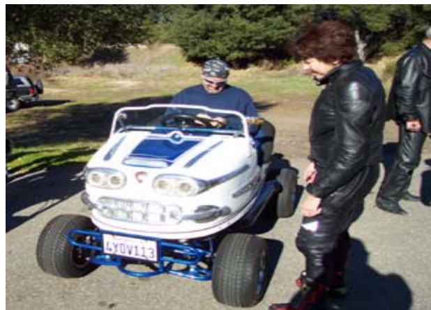
Coney Island Bumper Car + ATV = One Wild Ride!