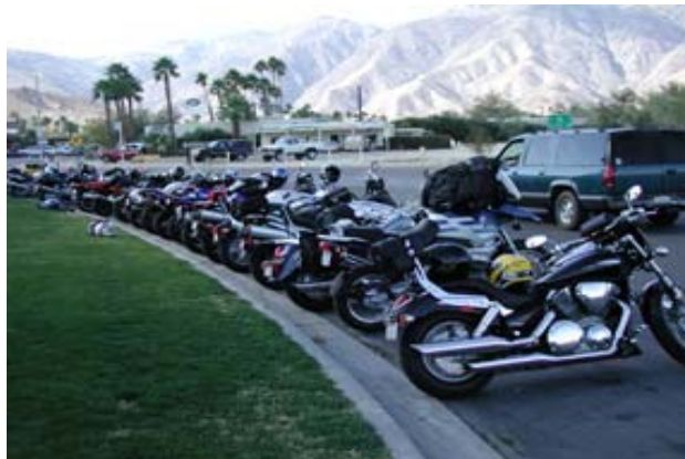
Borrego warmth at Christmas Circle

The warmth of the desert was a welcome change to all of us and the pace picked up just a little (not too fast—as it was assumed Office Patton, the local CHP would be on patrol!) The roller coaster ride of the highway and the short climb to Borrego was the end of the road, as we all headed into Christmas Circle for some lunch, bench racing and welcomed warmth.